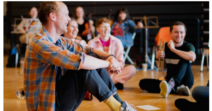
Teacher Training 2023