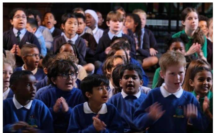
Photos from Proms at St Jude's and Wessex Gardens School 'Take Note'